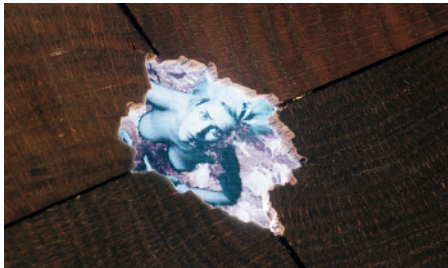
Selbstlos im Lavabad (Selfless In The Bath Of Lava), 1994 Audio video installation. LCD monitor let into the floor, sound system. Approx. 6 mins. video loop.

The work that is hidden in the stair down to the bottom level speaks to our empathetic side, our humanity – the will to help one another and be able to forgive others as well as ourselves. In the artist's own words: "It is important to me that people pay attention to one another and that we take each other seriously. (...) When viewers experience my work I hope they will stop being quite so hard on themselves. (...) It is part of my message to encourage mildness towards oneself." (from the publication Congratulations! )